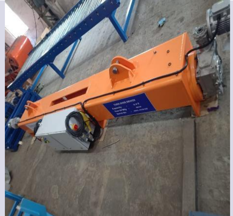
Component Inversion Device