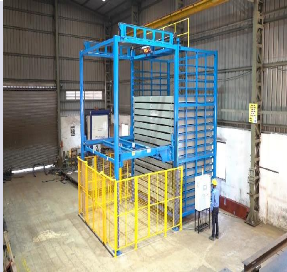
Vertical Storage System