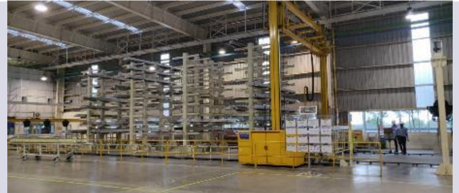
Storage with Stacker Crane System