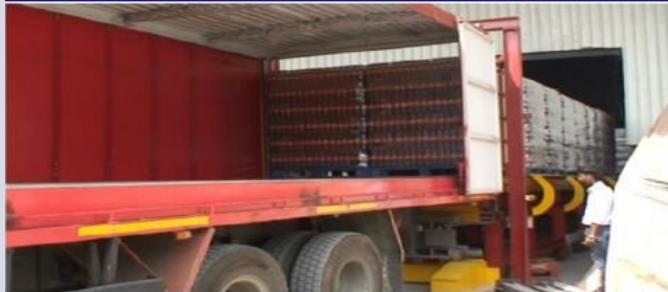
Auto Loading Dock – Customized truck