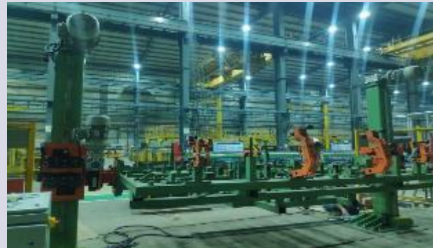
Welding and Assembly Manipulators