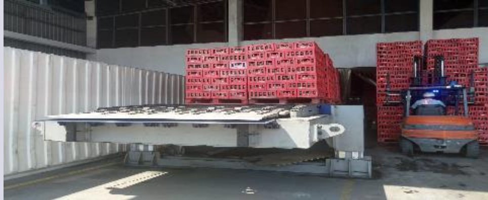
Auto Loading Dock – Market Truck