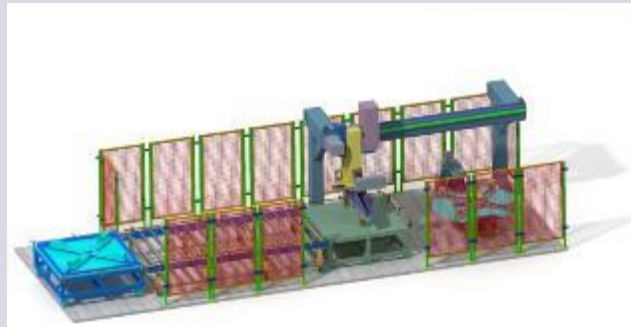
Pick and Place System