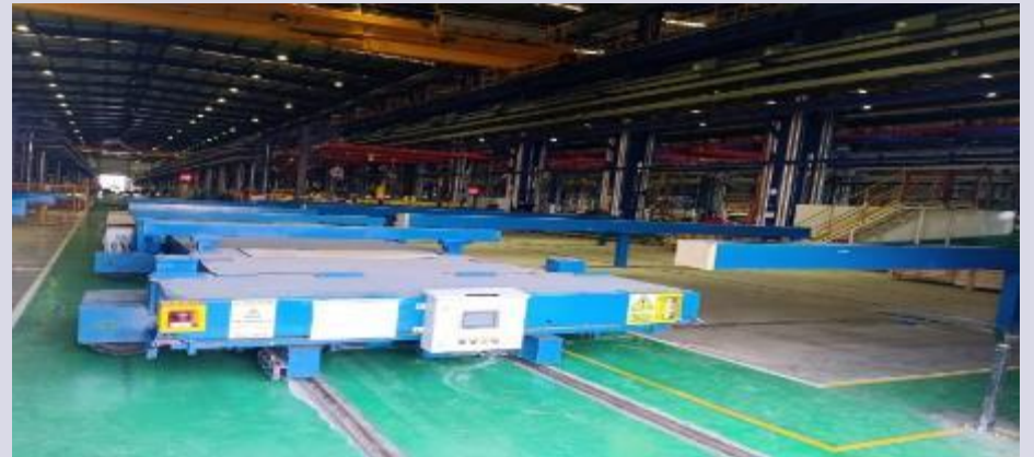
Roof and underframe storage shuttle