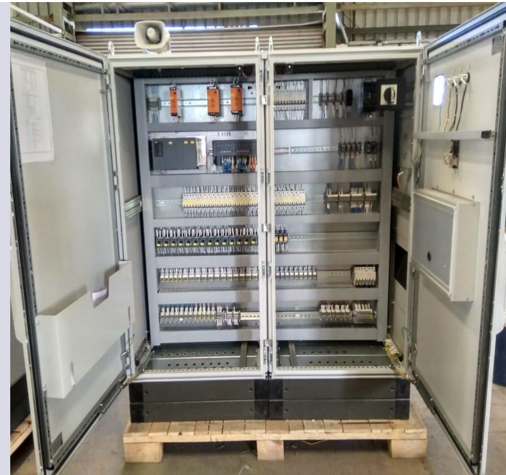
Control Panels and Integration