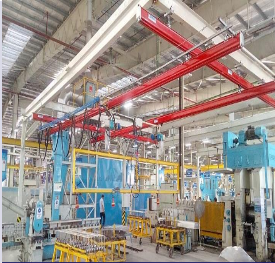
X-Y Rail, EOT, Semi Gantry & Gantry Cranes