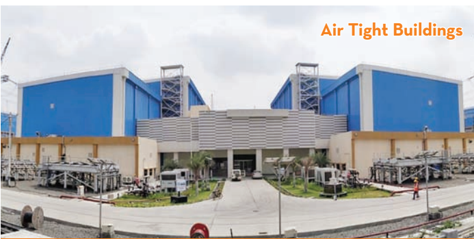
HITACHI ABB POWER GRIDS - TN, CHATTISGARH