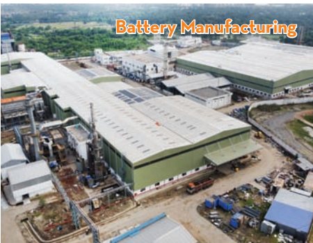
EXIDE INDUSTRIES - WB