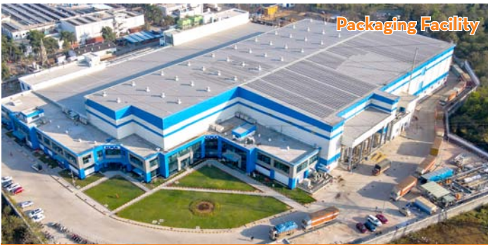
ALPLA INDIA - SILVASSA