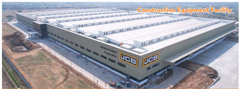
JCB INDIA - GUJARAT