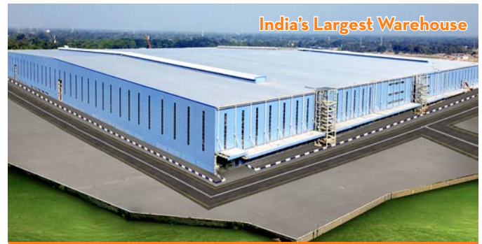
FLIPKART - WB