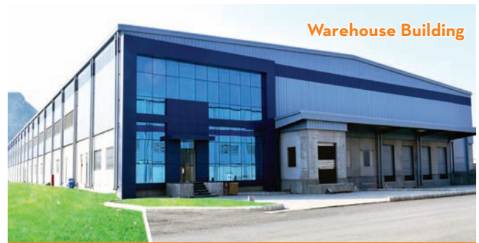
INDOSPACE LOGISTICS - Multiple Locations